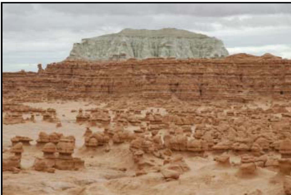
Goblin State Park

Always check out the RaM Experience Board before you head out to a climbing area. There might be an important message. Should you encounter anything special could we kindly ask you to add your experience/comment to the RaM Experience Board. A big thanks from all the other climbers.