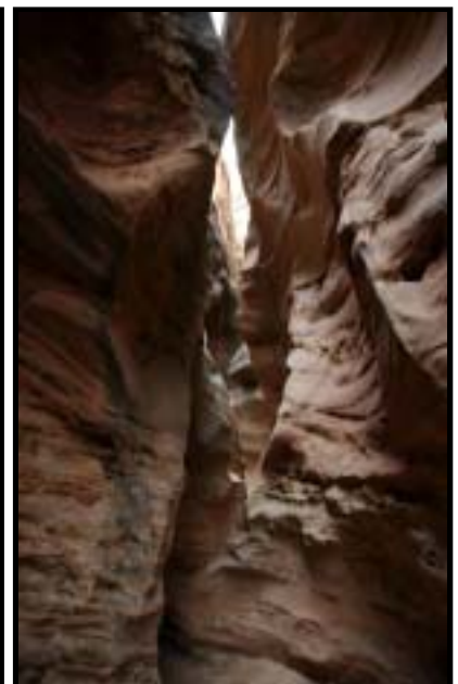
Little Wild Horse Canyon