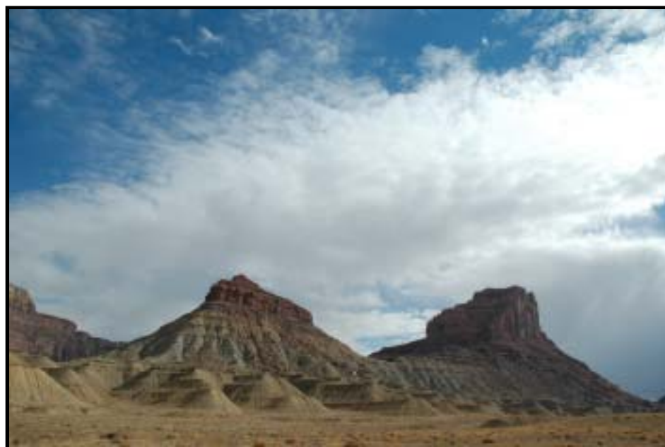
On the way from Interstate 70 to the San Rafael River